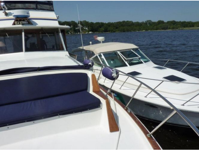
Wanderer III & Vitamin Sea